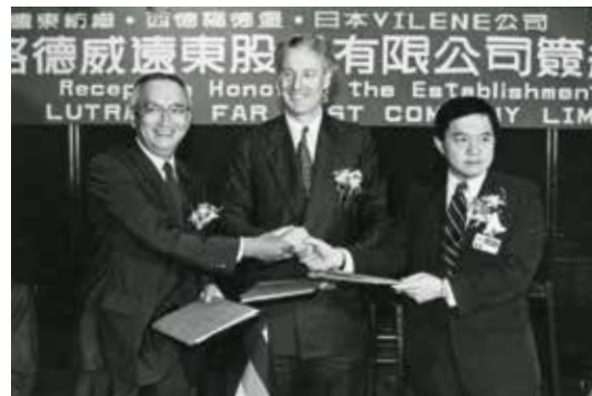
Signing of the contract establishing Lutravil Far East, 1987