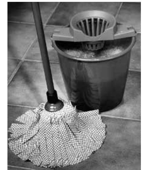
The wet mop, a classic Vileda product, 1985