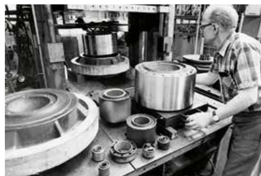
Production of vibration control ultra bushings, 1957

The next diversification steps follow in 1957. First Freudenberg becomes involved in vibration control technology, which complements its expertise from sealing technology. The company produces shock absorbers, antivibration mountings and ultra bushings under the name Metalastik. A partnership with the Italian seal manufacturer Corte & Cosso is formed. In the same year the product area of technical nonwovens is established with the first filters.