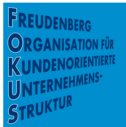
Logo of the FOKUS project

Launch of the TANNER youth exchange program, development of the Evolon® microfiber nonwoven, entry into vibration control technology for rail vehicles