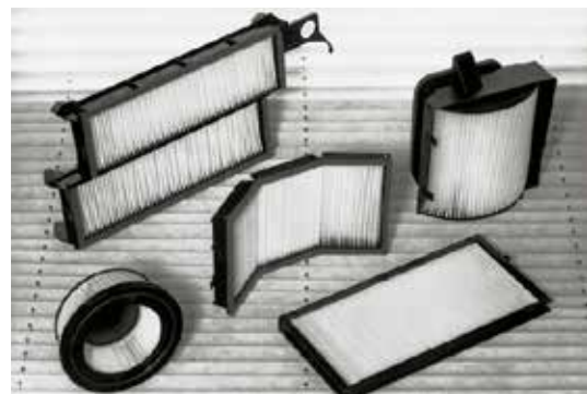
First micronAir® brand car cabin air filters, 1992

In 1990, Freudenberg establishes the "Unterstützungskasse", an assistance fund for employees in need. In this way, the idea to help employees experiencing hardship in a non-bureaucratic way, is continued. The fund provides advice and financial support to employees and their families facing difficult situations such as accidents, sickness, disability, old age and death.