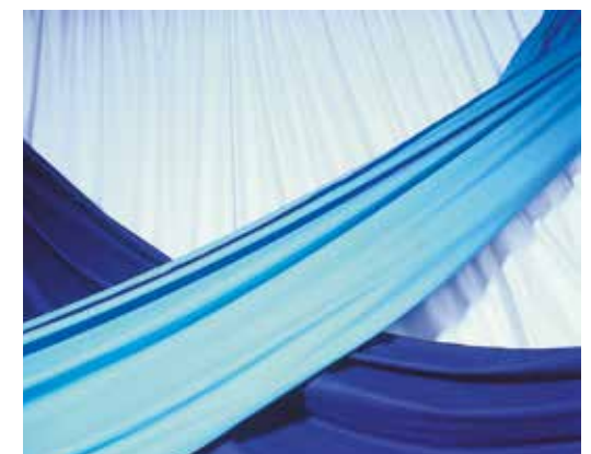
Evolon®, the first microfiber nonwoven from Freudenberg, 1999