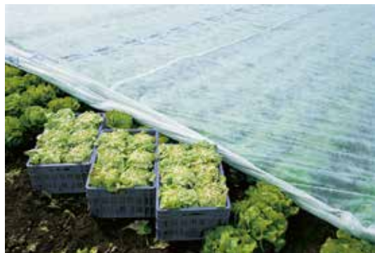
Spunbonded nonwovens protect the crop against adverse weather conditions, temperature fluctuations and pests, in about 1970

An innovation by Dr. Ludwig Hartmann results in a new production technology for nonwovens. This new spunbonded nonwoven technology allows Freudenberg to develop nonwovens for new application areas, such as wound dressings in medical technology and harvest nonwovens in agriculture. The first plant with the new spunbonded nonwoven technology begins production in Kaiserslautern, Germany, in 1970.