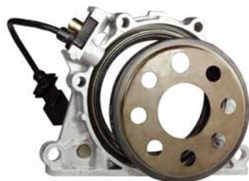
Sensor Simmerring with integrated encoder, 1997

In the same year Freudenberg Politex Nonwovens SpA is established in Novedrate, Italy for the production of polyester nonwovens made from recycled PET bottles. In 2004, Freudenberg assumes 100 % control of the Joint Venture with Italian partners.