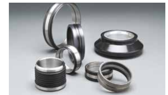
Sealing products for the oil and gas industry