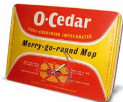
O-Cedar® mop head, 2006

In the same year Freudenberg Household Products acquires the US company O'Cedar Brands with the brand O'Cedar®. The company is integrated into Freudenberg Household Products.