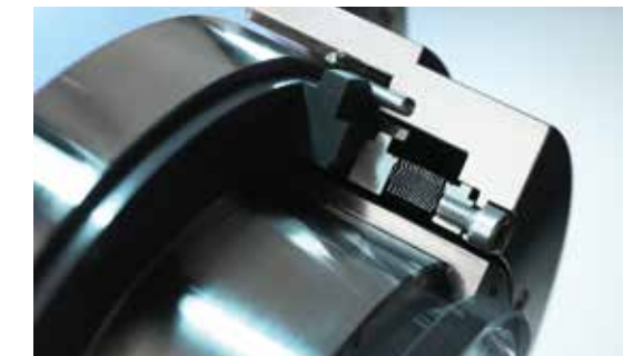
Burgmann mechanical seal, 2004

In 2007, Freudenberg separates from its floor covering business. Freudenberg Building Systems KG, with its nora® brand, is sold to a consortium of investors and continues production in Weinheim. Today, the company operates under the name nora Systems.