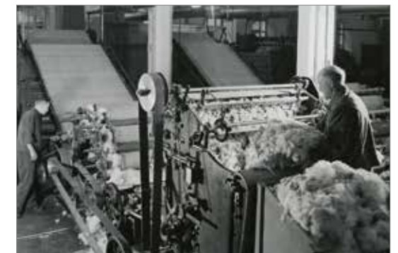
Nonwoven production, 1938