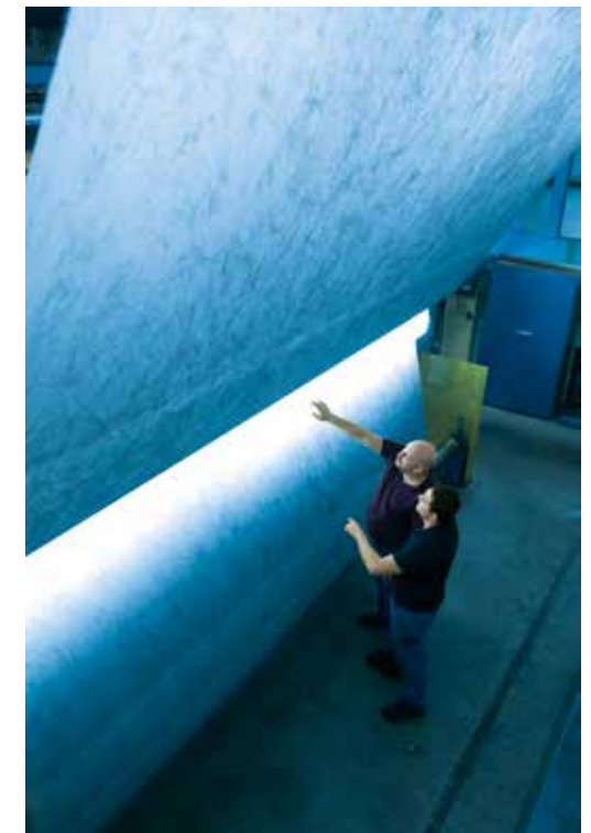
Nonwovens production at Freudenberg Performance Materials, 2015

The joint venture Trelleborg Vibracoustic for the production of vibration engineering solutions for the global automotive and commercial vehicle industry is renamed Vibracoustic.