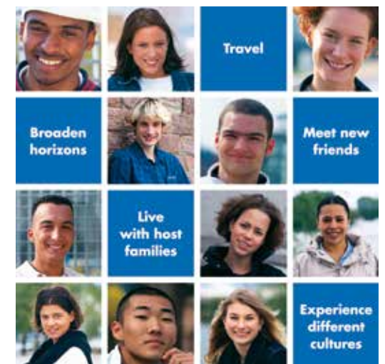
TANNER youth exchange program

In 1999, Freudenberg sells the Tack shoe retailing chain, reducing the size of the company's shoe division. With the sale of Elefanten GmbH (children's shoes) in 2001, Freudenberg cuts its last ties with shoe production.