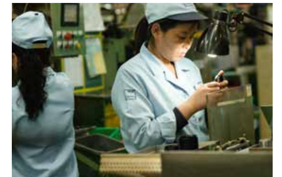
Production of oil seals in China, in about 1995

Freudenberg's involvement in the BRIC countries (Brazil, Russia, India and China) has a long tradition. The first business relationships in Brazil and Russia date back to the 1850s, followed by India in the 1860s and China in the 1920s. From the mid-1990s, the markets in the BRIC countries are systematically developed.