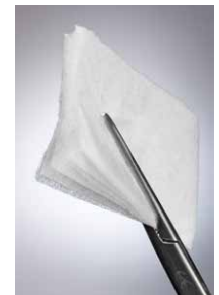
scaffolene® nonwovens for wound care, 2011

In 2011 Freudenberg Household Products takes over the operative business of Trade & Investment in Asia Limited (TIA) with locations in China, Hong Kong, Thailand, Indonesia, Malaysia and Taiwan as well as the swash® brand.