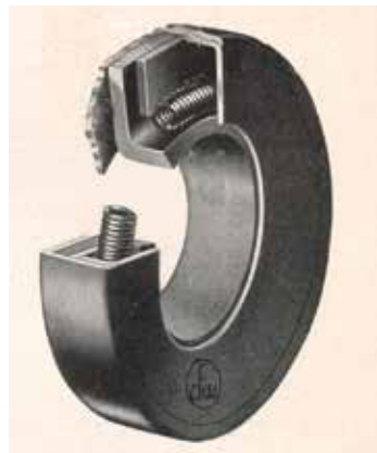
Simmerring® with garter spring, 1932

From 1932 a new era at Freudenberg begins with the revolutionary Simmerring®: sealing technology. Its name is taken from the Freudenberg developer Walther Simmer. The Simmerring®, a radial shaft sealing ring for sealing rotating shafts replaces the felt seals previously used. These had often resulted in overheating seals and damage to engine and axle bearings. The Simmerring® delivers significantly better results from the very start. It consists of a sheet metal housing with an integrated leather sleeve. Using a garter spring improves the radial force and sealing performance.