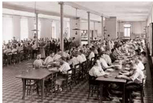
Dining room in the Müll plant, 1899

First foreign company established, expansion to Asia