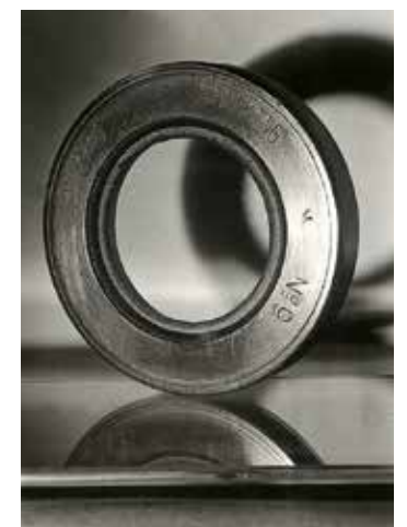
Simmerring® with NBR sealing lip, 1938

The training workshop is established and starts to train apprentices in metalworking, woodworking, electrical, tanning and other vocations.