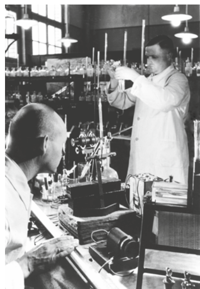
Experiments in main laboratory, 1934