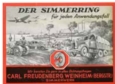
Newspaper advertisement "The Simmering for every application", from Motor-Kritik, 1942

The diversification initiated before the war means it is easier to compensate for the difficult raw materials situation than in World War I, as the company is no longer exclusively active in the leather business. Therefore, the number of employees decreases only slightly from 4,350 in 1938 to just under 4,000 in 1945.