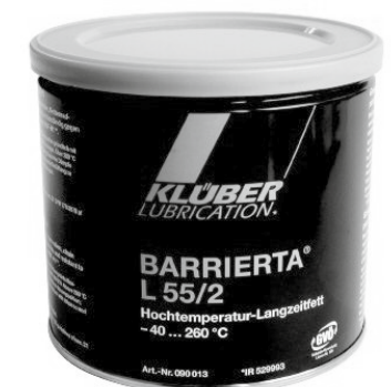
Klüber BARRIERTA high-performance lubricant, in about 1966