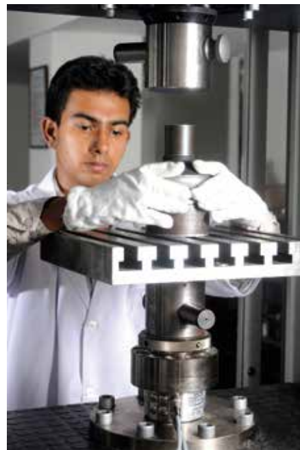
Production of oil seals in Mohali, in about 2003

By 2000, the company employs more than 30,000 people worldwide.