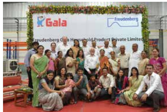
Opening of the Gala production plant in Adas in 2011

Further strategic milestones, ground-breaking innovation to save resources, pioneering innovation in wound care, further expansion of household products in Asia