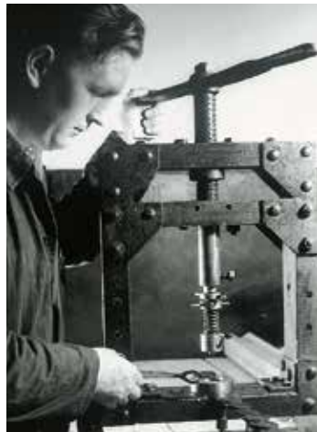
First seals produced on a spindle press, 1929

Entry into shoe business, start of Nazi dictatorship