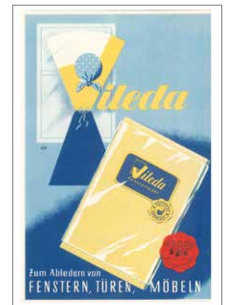
Vileda advertisement, about 1950

After the currency reform, Freudenberg builds on a distribution system and in 1948 founds the Frema plant in cooperation with the textile firm Martini in Augsburg, Germany. The production of Vileda cloths begins there in the same year.