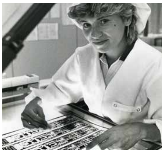
Simflex brand flexible printed circuit boards production, 1984

In Hong Kong, Freudenberg & Vilene International Ltd. Hong Kong is established in 1977. Freudenberg Trading Hong Kong Ltd. is established for sales.