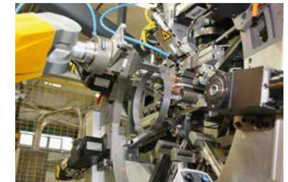
SUL plant at the Weinheim HQ, 2011

The creation of the new Business Groups Freudenberg Oil & Gas, Helix Medical and Freudenberg Schwab on January 1, 2011 is a clear indication of Freudenberg's plans for strategic growth. As part of its buy-and-build strategy, the company subsequently introduces new technologies to support these Business Groups. 2012 sees the acquisition of Med-Venture, which adds minimally invasive surgery solutions to the company's medical devices portfolio, while the acquisition of Cambus Medical allows Freudenberg to supply high-precision hypotubes and micro-component devices for technologically advanced catheter systems. The acquisition of Vector Technology Group in 2013 makes Freudenberg Oil & Gas one of the leading manufacturers of seals and sealing solutions for the upstream segments of the oil and gas market.