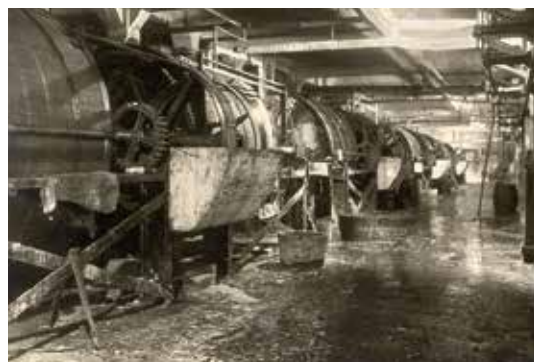
Chrome tannery, 1904

With the outbreak of the First World War, leather business slumps significantly. Heavy declines in orders caused by the shortage of raw materials and conscription for military service means that the number of employees drops significantly – by more than 2,500 to about 800. The women take on some of the conscripted men's work until they return.