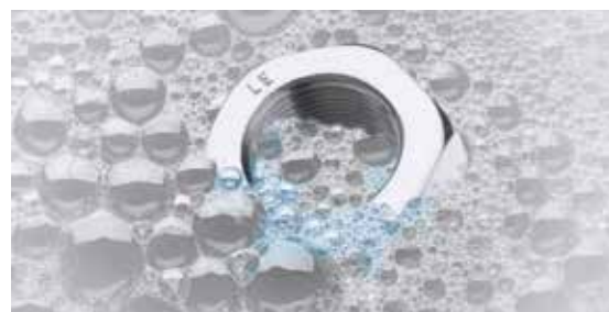
SurTec surface finishing, 2010

With the acquisition of SurTec in Zwingenberg, Germany, in 2010 Freudenberg Chemical Specialties expands its portfolio to include a fourth pillar: surface finishing. In 2013, the business is expanded through the acquisition of the shares of Capol GmbH in Elmshorn, Germany, a manufacturer of glazing and release agents for the confectionery industry.