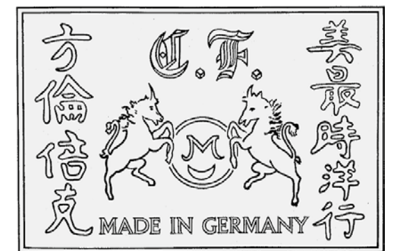
Leather label for export to China, 1923