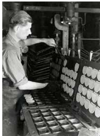
Manufacture of nora® heels, in about 1940