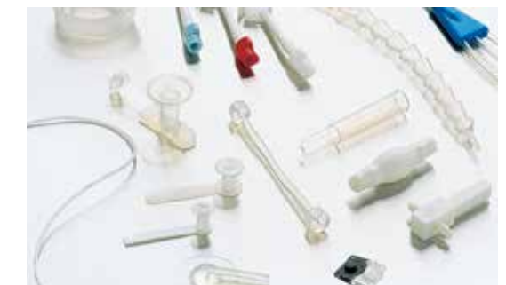
Medical products from Helix