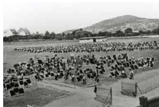
The "panel field" next to the lacquering shop: the panels with patent leather are dried in the sun

At the same time, the first overseas branch is opened in the UK. A global procurement (rawhide import) and sales network is established, including business relationships with Italy (1851), Scandinavia (1852), Brazil (1853), Spain (1854), Russia (1855) and India (1867).