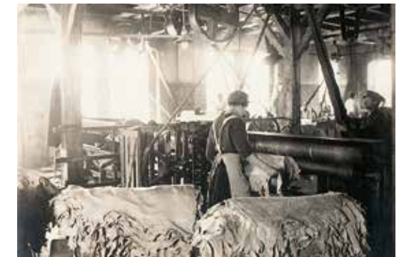
During World War I, women took the place of their husbands, doing the latter's work in the tannery, 1916